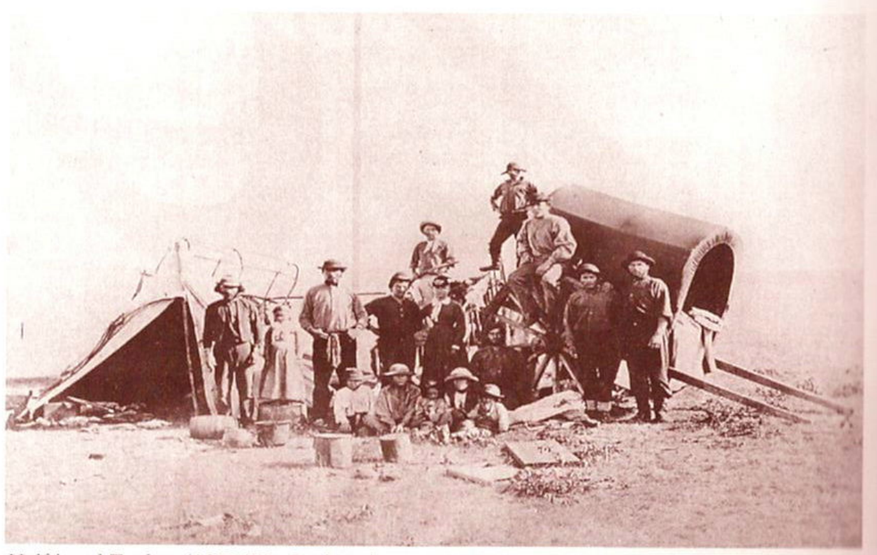
Half-breed Traders (1872-75).

fight.... During the mornings march passed where the Half-Breeds had been running buffalo a few days before. The hillsides and valleys strewn with carcasses. Those in best condition had been completely stripped, while the poorer ones and old bulls had only the tit [sic] bits removed."